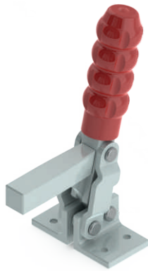
Model No.VTC-6561 A